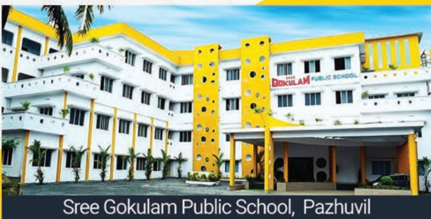
Sree Gokulam Public School, Pazhuvil