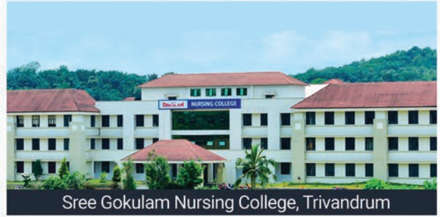
Sree Gokulam Nursing College, Trivandrum