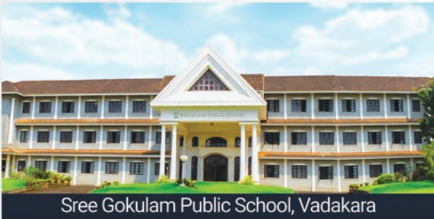
Sree Gokulam Public School, Vadakara