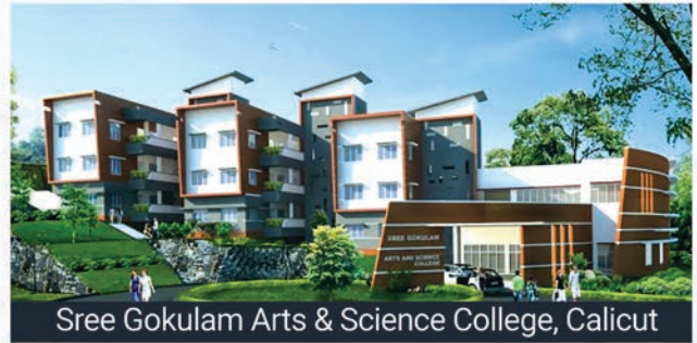
Sree Gokulam Arts & Science College, Calicut