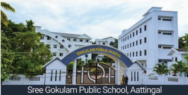
Sree Gokulam Public School, Aattungal