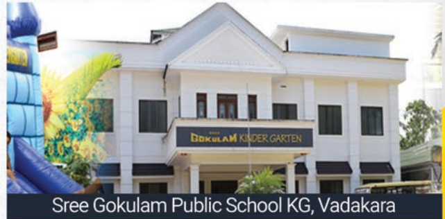
Sree Gokulam Public School KG, Vadakara