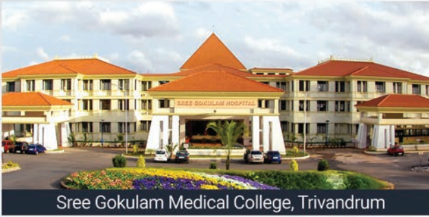
Sree Gokulam Medical College, Trivandrum