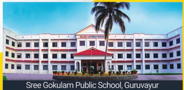
Sree Gokulam Public School, Guruvayur