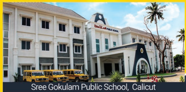
Sree Gokulam Public School, Calicut