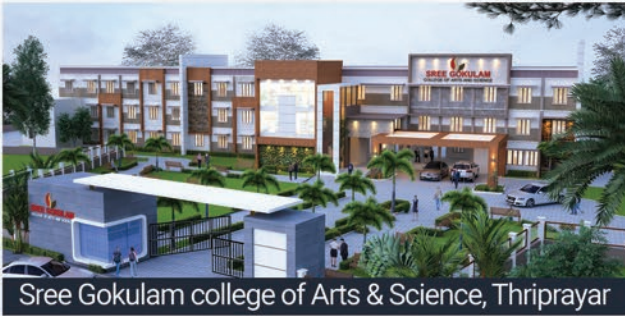
Sree Gokulam college of Arts & Science, Thriprayar